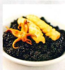
Left: Münferit and, above, its dish of calamari on black couscous. Bottom, Sunset Grill & Bar